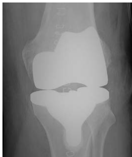
Total knee replacement, front view.