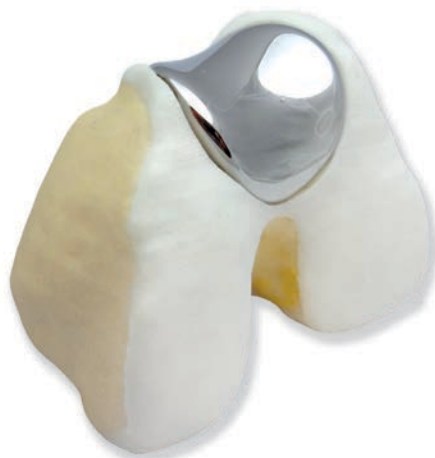
Fig. 2 – An actual custom made KineMatch PFR implant on a CT based model of the patient's knee.