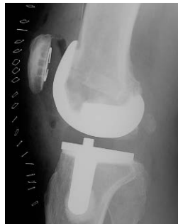
Total knee replacement, side view.