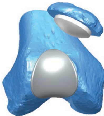
Fig. 1 – A virtual computer model of a patient's knee showing the design for the patient's KineMatch custom made implant

Partial knee replacement with the KineMatch Custom PFR is covered by most insurance plans.