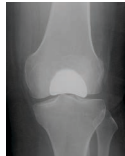
KineMatch Custom PFR, front view.